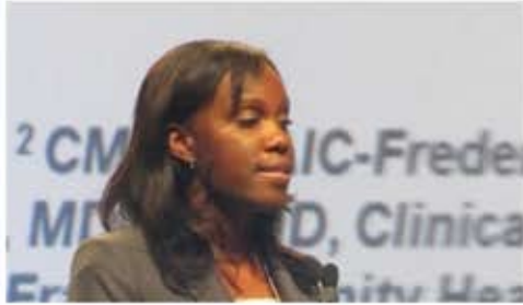
The Liver Meeting 2012, the recent 63rd Annual Meeting of the American Association for the Study of Liver Diseases (AASLD) in Boston. Reducing the ribavirin dose, however, lowered response rate